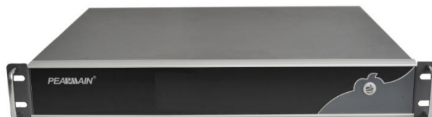
1.5RU chassis with 4ch HDMI output cards