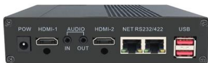
Stand-alone configuration 2ch HDMI output

This was the idea behind the development of the PM70V2 ip matrix: the IP PTZ is operated much like a typical Analog PTZ system with each PTZ being assigned an IP address on the network switch and the communication path/language is over ip protocol.